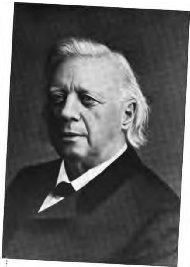
Henry Wood Beecher